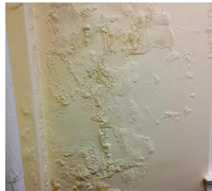
Shows detail of damage or non-updated feature