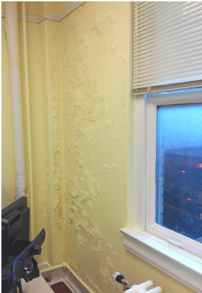
Shows whole room or exterior facade