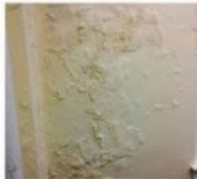
Shows detail of damage or non-updated feature