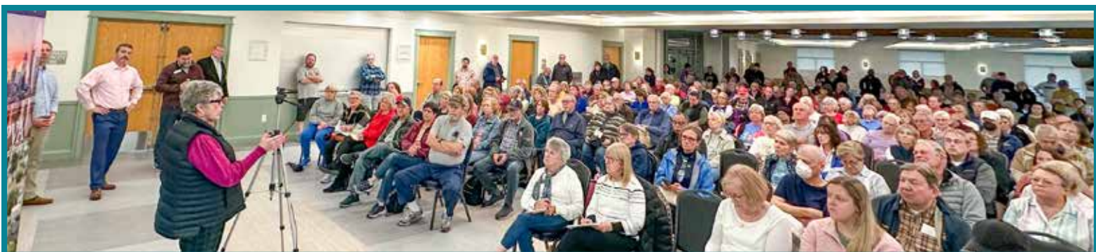
2024 Community Meeting at The Arterburn in St. Matthews