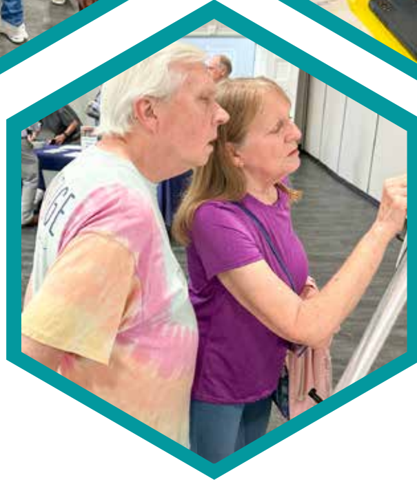
Taxpayers Comparing Reassessment Areas