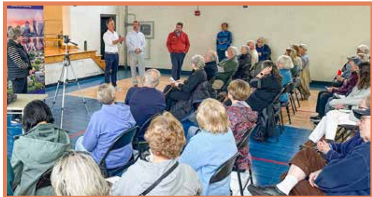
2024 Community Meeting at The Douglass Community Center in the Highlands

Our “You Have a Right to Appeal” public outreach program was recognized by the National Association of Counties (NACo) with a 2024 Civic Education and Public Information Achievement Award . NACo describes those distinguished with this award as county organizations that “enrich the public’s understanding of county government and elevate awareness of county services.”