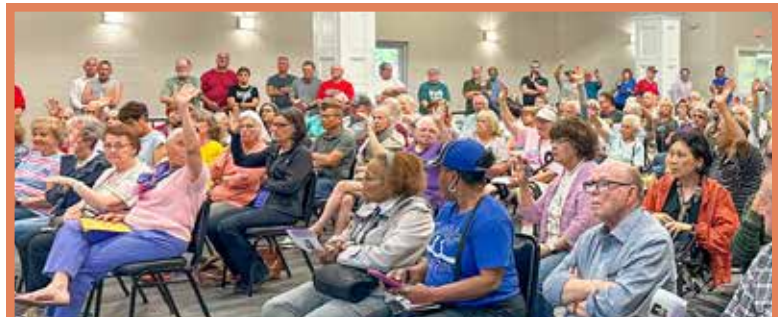
2024 Community Meeting at The Jeffersonian in Jeffersontown