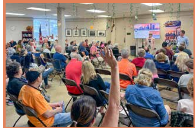
Community Meeting at The United Crescent Hill Ministries