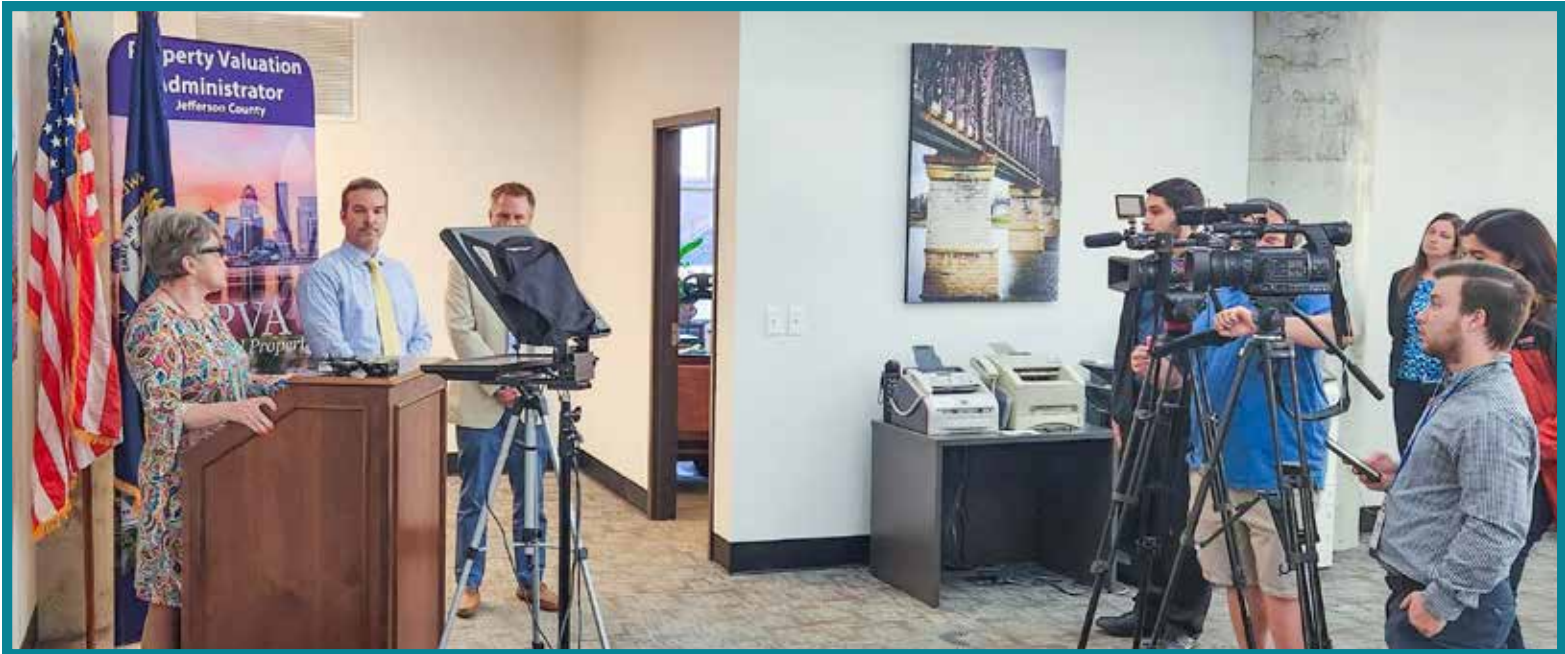
2024 State of The Real Estate Press Conference