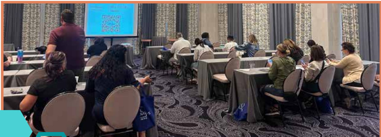
2024 P.A. Douglass Management Course in Nashville, Tennessee