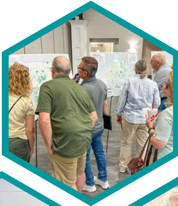
Taxpayers Locating Property on PVA Reassessment Map

“I just wanted to thank you for an informational, transparent, and much needed gathering. Kudos to you and your staff for taking the time to help inform the public. I wish every government entity could be as efficient and forthcoming.” -Community Member