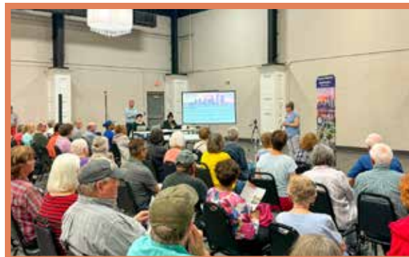
Community Meeting at The Jeffersonian in Jeffersontown